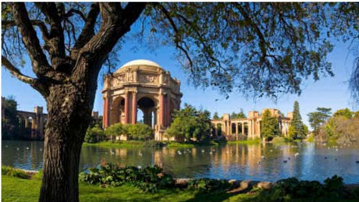
Palace of Fine Arts